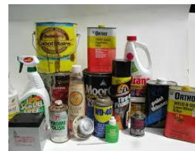
Household Hazardous Waste- ask for details Paints & Stains (fees)