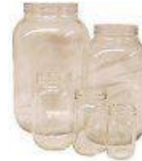
Clear glass jars