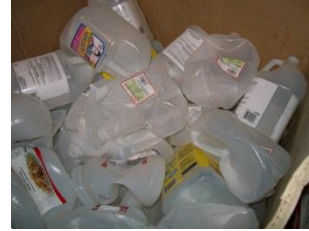
#2 Natural bottles