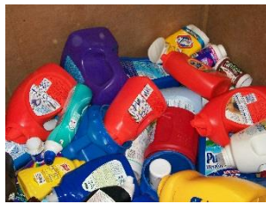
#2 Colored bottles