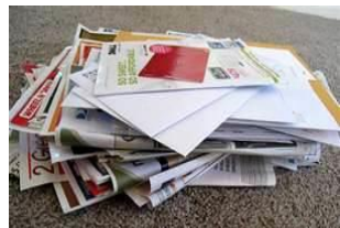
Paper/ junk mail