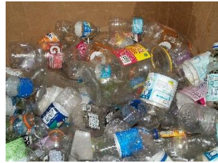
#1 Clear bottles