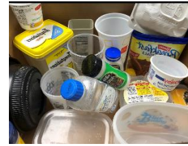
#5 tubs, trays, cups