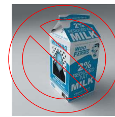
Wax covered cartons