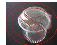
#1 plastic trays